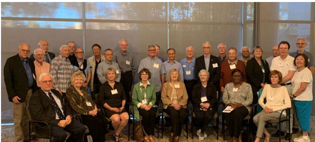
Photo taken at the 2019 Chancellor's Scholars Opening Reception