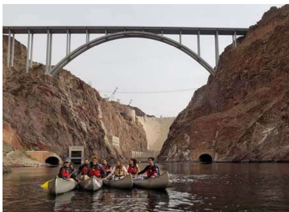
Floating in front of the Hoover Dam

Thank you once again to all of the donors and to UCSD Outback Adventures for making this trip possible.