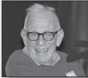
Walter Munk

SIO oceanographer Walter Munk , who won the National Medal of Science in 1983, the Kyoto Prize for Basic Science in 1999, and the Prince Albert I Medal (awarded by Monaco) in 2001, has garnered yet another high honor. He is the designated recipient of the Crafoord Prize, awarded by the Royal Swedish Academy of Sciences to researchers who have made major advancements in their branches of science. The academy recognized Munk “for his pioneering and fundamental contributions to our understanding of ocean circulation, tides and waves, and their role in the Earth’s dynamics.”