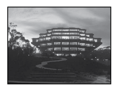
Chronicles November 2008