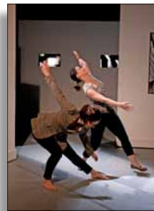
“Space Between” (2011)