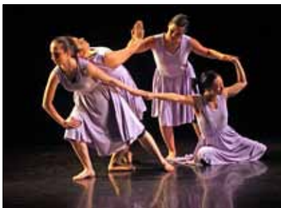
Stories of the Cottage (2009) “Tea Shelter”