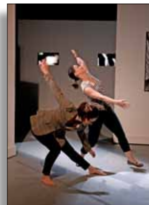
“Space Between” (2011)