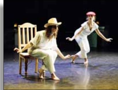
“Walking Words” (2004)