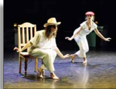
“Walking Words” (2004)